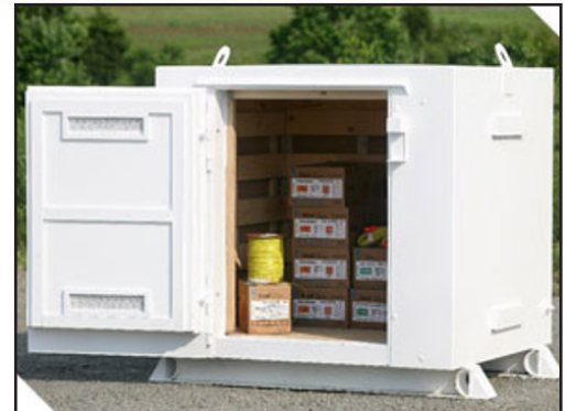
Learn how to correctly and safely handle, transport and store explosives

SPECIAL ROOM RATE: Room reservations are the responsibility of each attendee. Individual guests will be responsible for their own guest room and incidental charges.